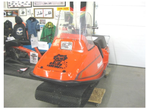
The 1980 Finncat has a new home!