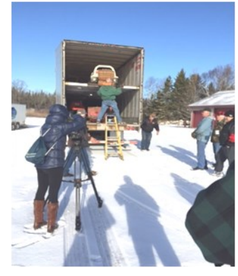
TV 9&10 and TV6 were here to film the Unloading Day