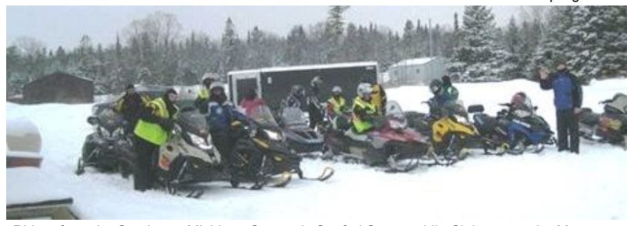
Riders from the Southeast Michigan Snomads Snofari Snowmobile Club stop at the Museum. A big thank you to the Club for their generous donation for the Bombardier Addition!

20 members of the Snomads Snofari Snowmobile Club members were here in full force today. Some of them come every year. I wasn't able to talk to them very much because we had 95 people at the Museum today! Another record broken (except for our show weekend.) We had 350 visitors visit the Museum that weekend.