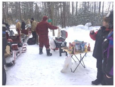
Time for Lunch on the Trail!