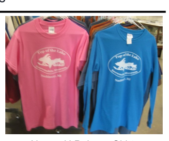
Above: U.P. Logo Shirts